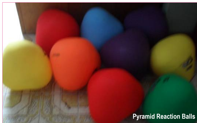
Pyramid Reaction Balls